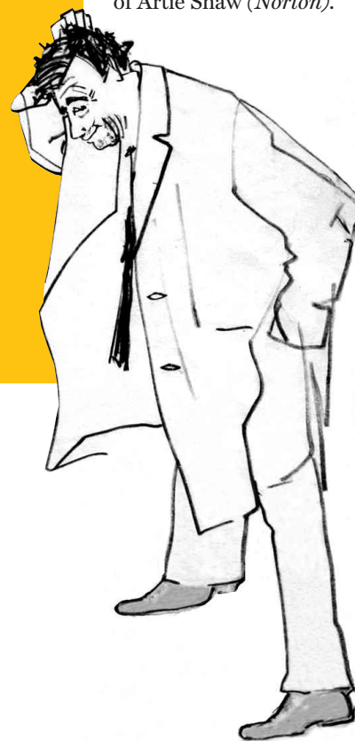
This pen and ink sketch by the actor Peter Falk of himself in his most famous role is one of the highlights of the Mystery Scene art collection.