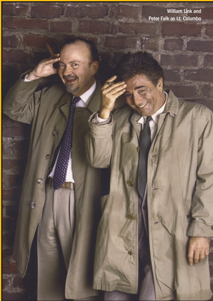
William Link and Peter Falk as Lt. Columbo