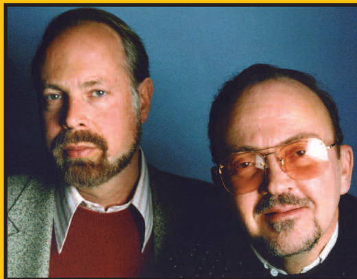
William Link and the late Richard Levinson (left), shown here in 1987, also created such TV classics as Murder, She Wrote and Mannix .

"Bernard Shaw once said, "There are some people so valuable and so important in your life that you only lose them with your death'... and I find in the case of Dick Levinson, that's very, very true."